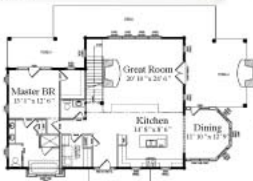
1st FLOOR PLAN (1565 SF)

The Oconee Cabin makes entertaining easy with this open floor plan. The dining room has a charming turret design that creates an intimate dinner party atmosphere. The great room and living porch doubles your entertaining areas. With flanking fireplaces you have the warmth of a fire inside and out.